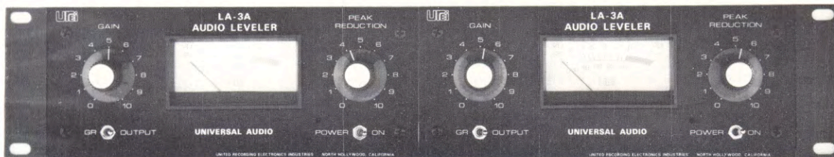
DUAL RACK MOUNTING — WITH ACCESSORY KIT DR-3A