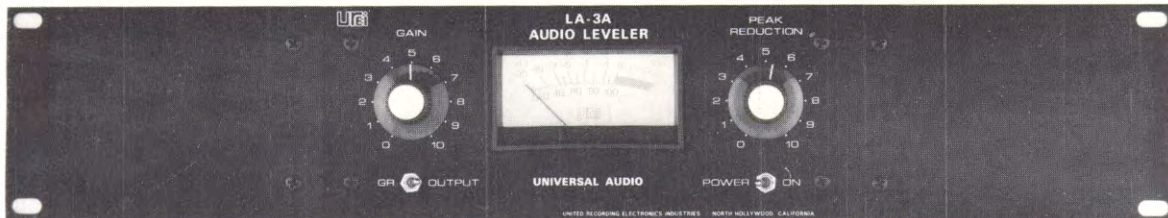
SINGLE RACK MOUNTING — WITH ACCESSORY KIT SR-3A